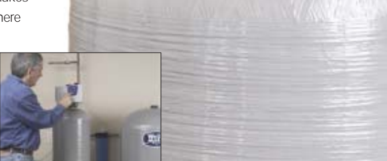
Installing a water softener system with a Fleck 7000 valve delivers the highest flow rates available in a residential system.

Manufactured from high-tech materials, the 7000 valve has been engineered and tested to withstand the equivalent of 27 years of uninterrupted daily use.