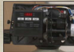
Advanced SE Electronic Timer

Your choice of the highly reliable 3200 mechanical timer or advanced SE electronic timer with easy programming and minimal parts.