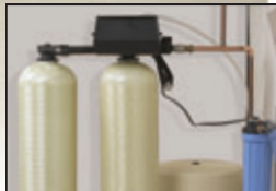
Installing a twin-tank softener featuring the Fleck 9100 valve can save significant amounts of water and salt.