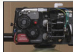
3200 Mechanical Timer

Choose the SE electronic timer, and you'll pay only $4.87 in electricity for the entire year. Choose the mechanical timer, and that cost is less than 25 cents per year!***